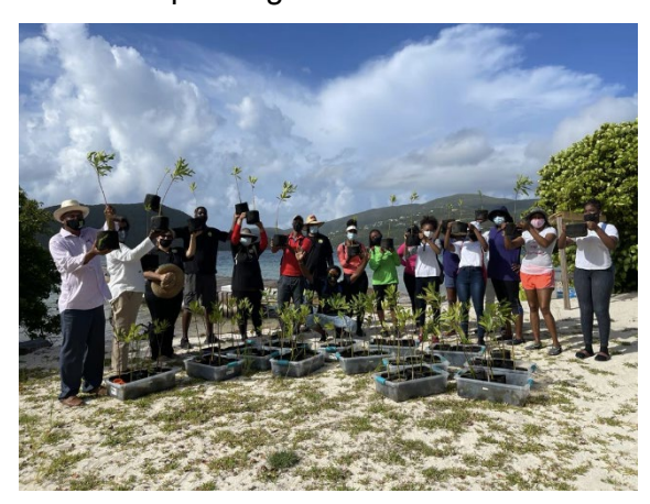
Above: (Left): Community volunteers assist with mangrove planting on Prickly Pear and (Right) the group of planters poses with seedlings provided by the HLSCC mangrove nursery.