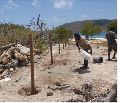
Above: NPTVI Staff installs fence at Prickly Pear National Park, Prickly Pear Island (North Sound, Virgin Gorda)