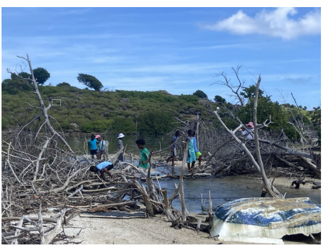
Above: (Left) Youth volunteer planting on JVD and (Right): An adult volunteer from JVD with her young son.