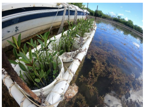
Above: Left: NPTVI Park Staff learn how to identify ripe red mangrove propagules for harvest; Center: NPTVI Board Member and Staff help assemble wet nursery troughs; and Right: successfully sprouted seedlings put into propagation in July are shown in early October 2021.